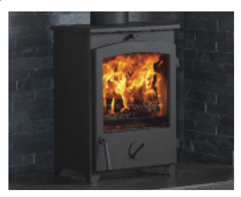
Charlton & Jenrick

Best of British fires, fireplaces & stoves